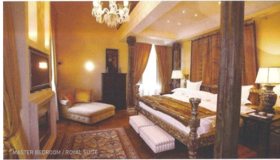
MASTER BEDROOM / ROYAL SUITE