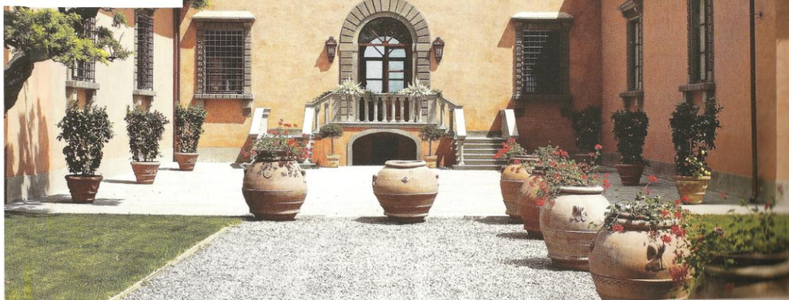
ITALIAN HIGH: Villa Mangiacane was originally built around 1535