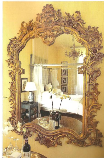
ITALIAN JOB! Clockwise from left: The main loggia at Villa Mangiacane; a Deluxe Room in the main villa; the pool at the tranquil indoor spa.